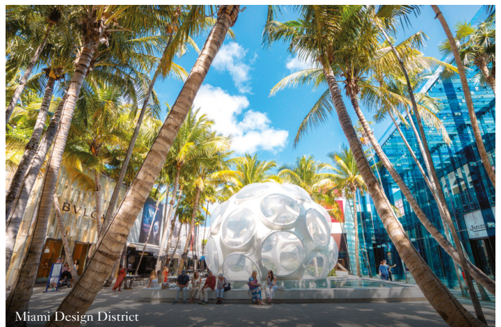
Miami Design District