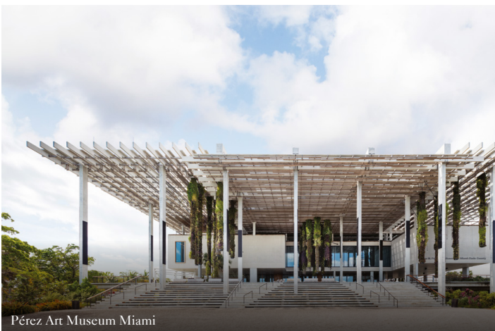
Pérez Art Museum Miami