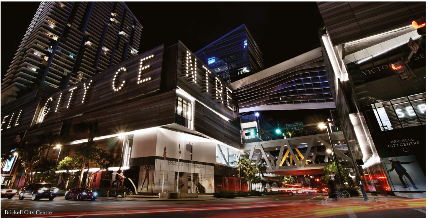
Brickell City Centre

Perfectly positioned at the entrance of Brickell Avenue, where the Miami River meets the beautiful blue waters of Biscayne Bay, and the bustling financial district blends with high-end shopping, top restaurants, cultural hot spots and exiting nightlife – this iconic neighborhood is an all-day all-night lifestyle destination, aptly named the Manhattan of the South.